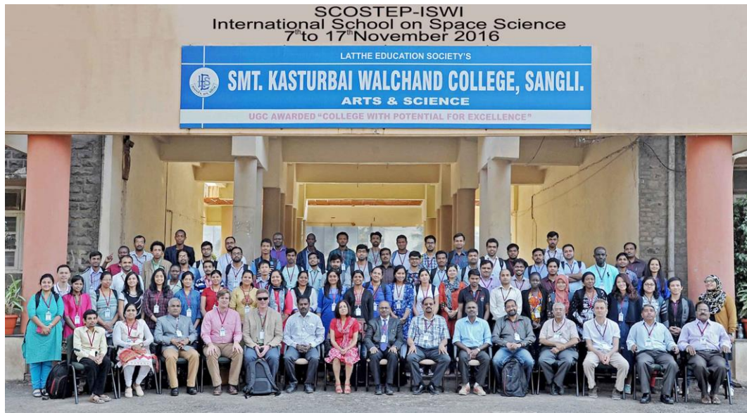
Figure 1. Group photo of the SCOSTEP-ISWI International School on Space Science held at Sangli Maharashtra, India, on 7-17 November 2016 with 74 graduate students from 14 countries (China, Egypt, Ethiopia, India, Indonesia, Ivory Coast, Kenya, Korea, Nigeria, Philippines, Rwanda, Thailand, Uganda, and Vietnam).

School Grants: SCOSTEP also supports organizers of the schools related to the solar-terrestrial physics by providing small supporting grants ( https://scostep.org/capacity-building/ ). The grants can be used to cover travel expenses, costs for visa application, accommodation and per diem of selected participants, registration fee waivers, and costs for online schools. SCOSTEP also endorses lecturers of the schools based on the SCOSTEP Science Disciplinary Representatives, National Adherents and other SCOSTEP-related officers.